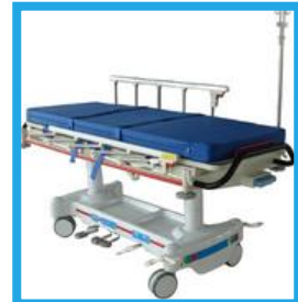
RADIO TRANSPARENT STRETCHER