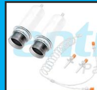
C.A.T. CONTRAST ENHANCED (BLOOD) EQUIPMENT AND SUPPLIES