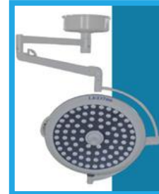
SURGICAL LED LAMP 160,000 LUXES PANELEX 1