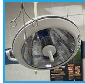
CEILING LIGHTS UPDATED AND NOT WORKING TIME AGO