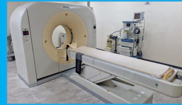
C.A.T. ACTUAL EQUIPMENT IN OPERATION