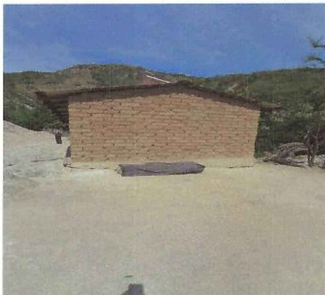
Fotografía del Despues